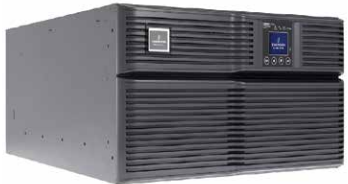
Liebert® GXT4™ 5 - 10 kVA