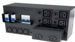
Front view Power Distribution (PD2-CE10HDWRMBS)