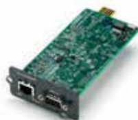
Liebert® IntelliSlot® Communication Card