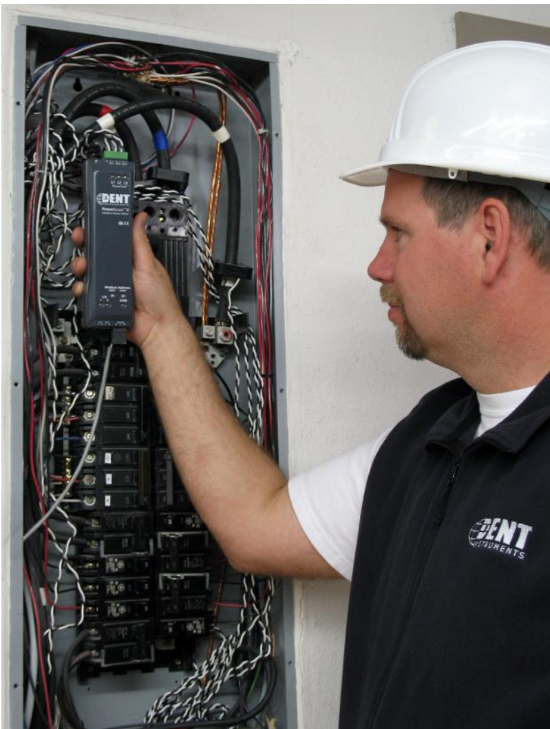
The Next Generation PowerScout™ 3 with Full Utility Metering™.