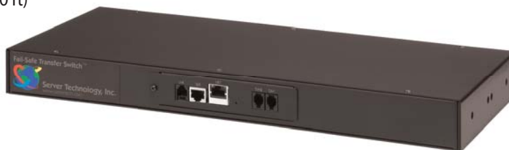
Network, link, and environmental ports on the opposite side