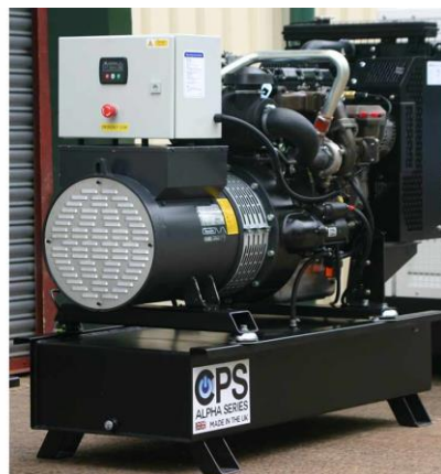
AP65/S-AP100/S, Three Phase, 65-100 kVa